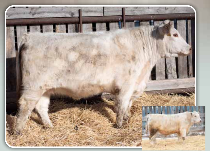
Bell M Mint 71E - Sire

Exposed to Diamond Creek Freight Train 9F April 23- August 1