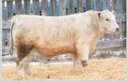
Bell M Mint 71E - Service Sire