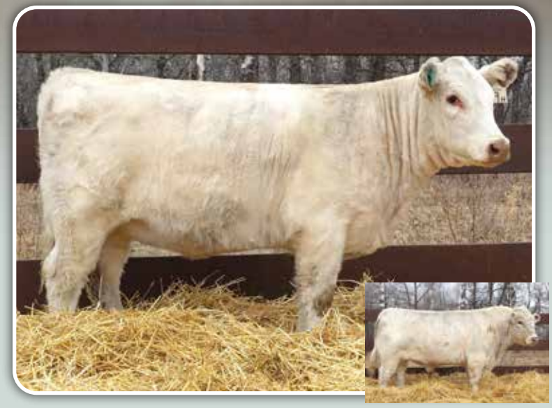
Rock Hill Mark VI - Sire