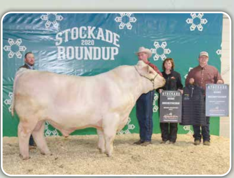
Bell M Titanium 47F - Grand Champion Bull 2020 Lloydminster Stockade Roundup - Service Sire of Lots 38 - 41

Pasture exposed May 27 to Aug 12 to Bell M Titanium 47F. Preg checked for mid April calving.